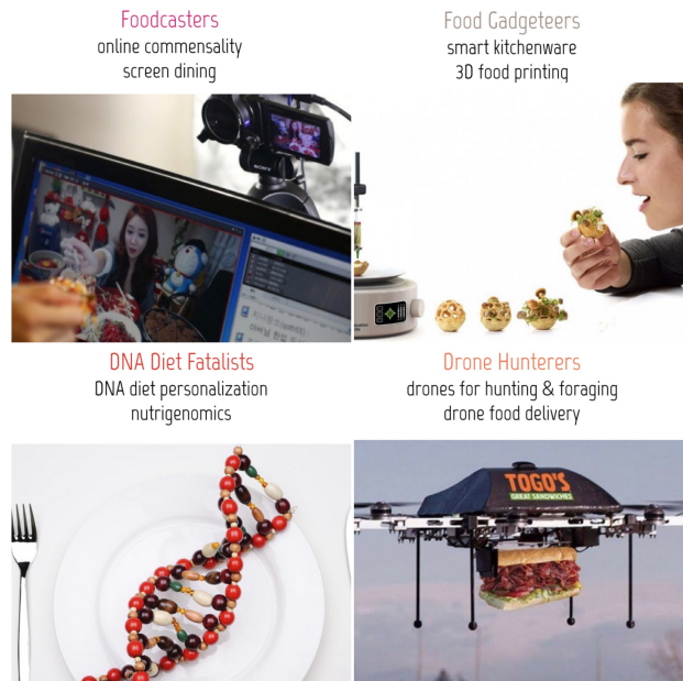
Figure 1: Digital Food Cards

Session 5 (4-6pm): We will ask every group to showcase their prototypes and scenarios and outline the design approaches that they have taken. The workshop will be wrapped-up by summarizing preliminary results related to the discussed issues and ideas.